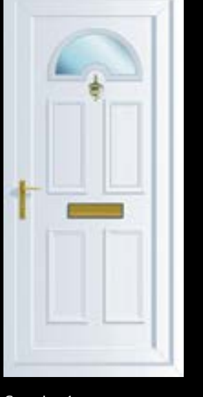
Georgian 1 GLAZED