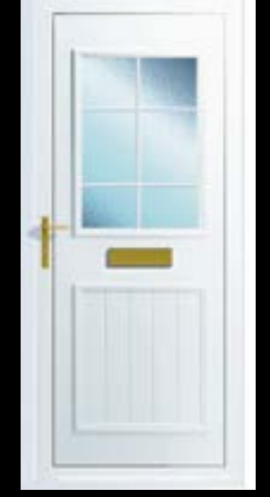
Back Door GEO BAR