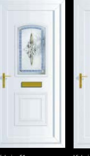
Victorian S1 COBALT