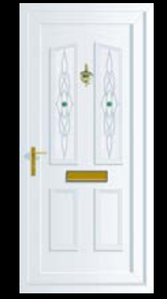
Windsor 2 EMERALD JEWEL