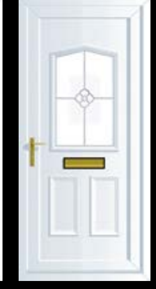
Jacobean 1 SILVER GRILLE