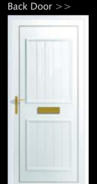
Back Door SOLID Back Door DIAMOND LEAD

(More designs are available if required)