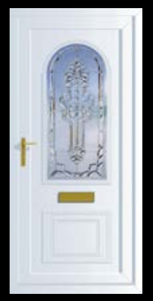
Devon NEPTUNE Devon ROYAL BEVEL* *optional blue or orange