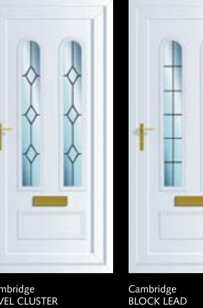
Cambridge BEVEL CLUSTER