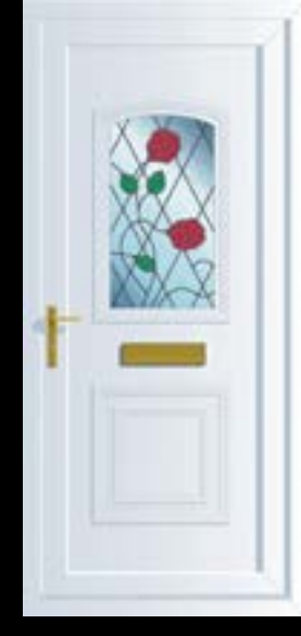
Victorian S1 BRIAR