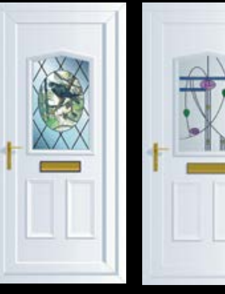
Jacobean 1 RENNI MORAY Jacobean 1 HAWK TRANSFER