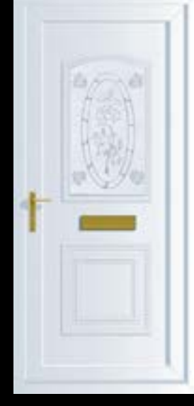
Victorian S1 WILD ROSE ETCHED