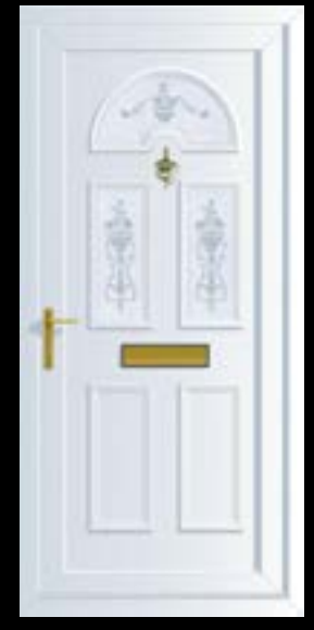
Georgian 3 FLORAL URN ETCHED