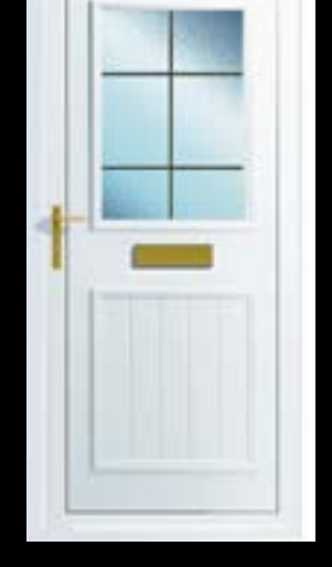
Back Door SQUARE LEAD