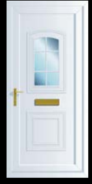
Victorian D1 GEORGIAN BAR