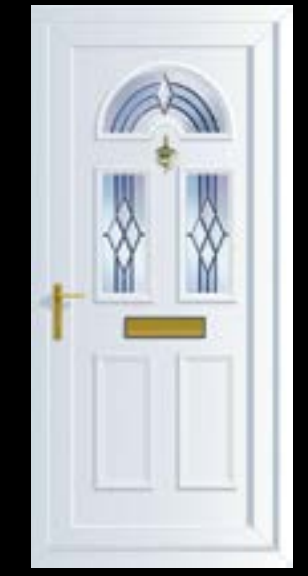
Georgian 3 DB8