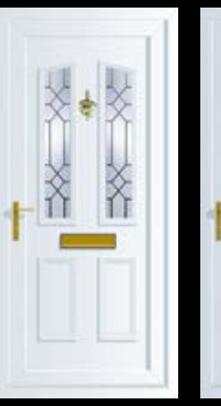
Windsor 2 CL5