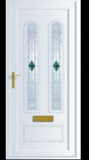
Cambridge FUSED GREEN