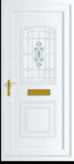
Victorian S1 TINTED EMERALD