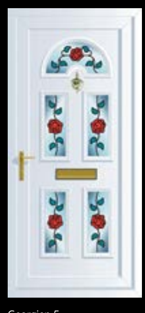
Georgian 5 RAMBLING ROSE