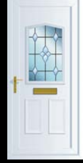
Jacobean 1 BEVEL A