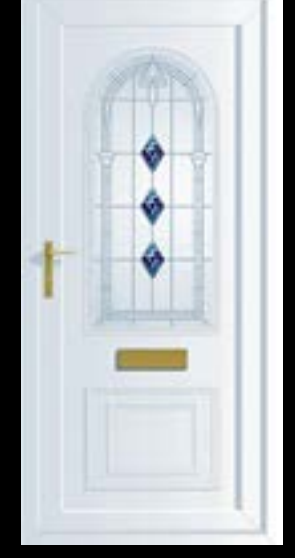
Devon FUSED BLUE