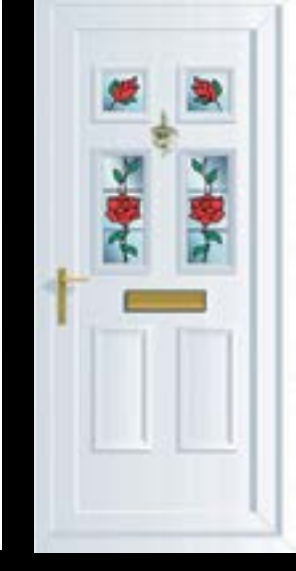
Edwardian 4 CLIMBING ROSE