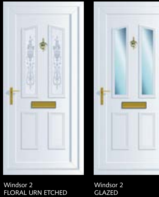
Windsor 2 GLAZED