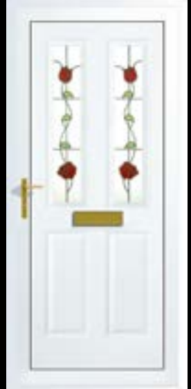
York 2 York 2 CD19 CD18