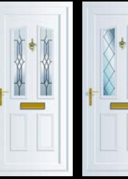
Windsor 2 DB4