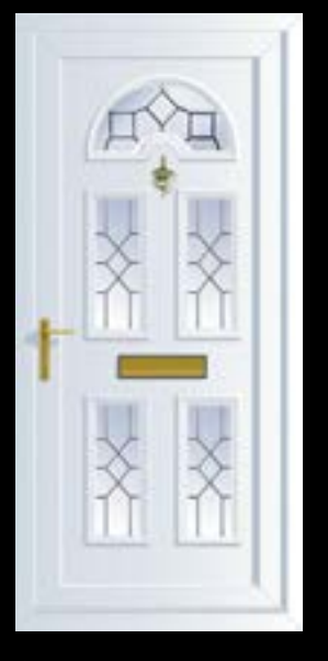
Georgian 5 CL5