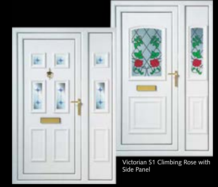
Edwardian 4 Bevel G with Edwardian 2 Bevel G side panel

Some doors are available with side panels to match. If you do not see the design you would like in this brochure we would be happy to discuss your personal requirements.