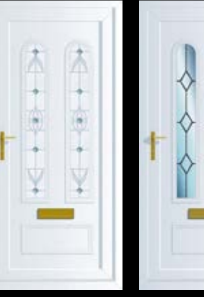
Cambridge AQUA PETAL