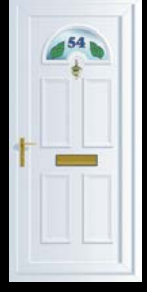
Georgian 1 HOUSE NUMBER & LEAVES