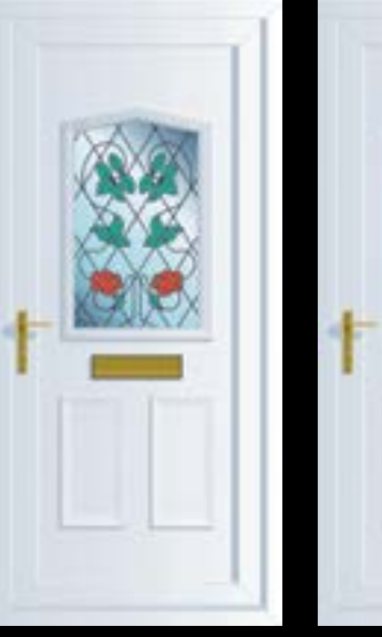
Jacobean 1 DB2