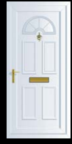
Georgian 1 SOLID