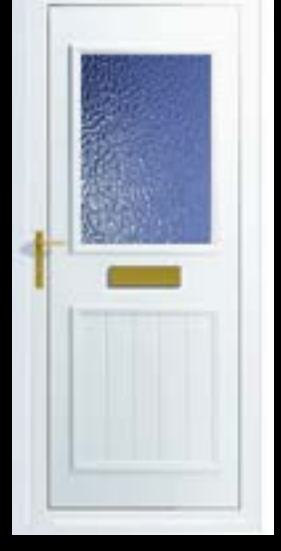
Back Door GLAZED