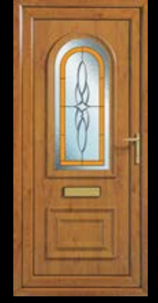
A selection of woodgrain finishes including Mahogany, Rosewood and Light Oak are available for all door styles.