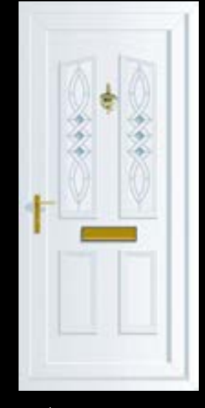
Windsor 2 SAPPHIRE TWIST