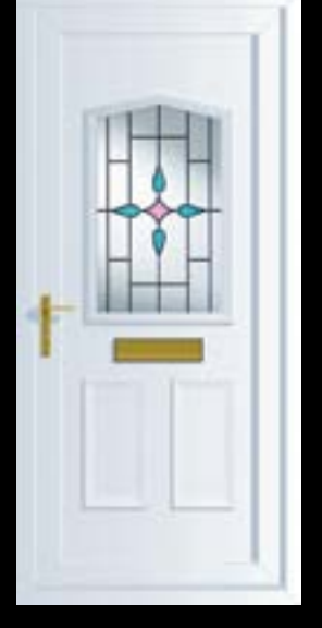
Jacobean 1 CD22