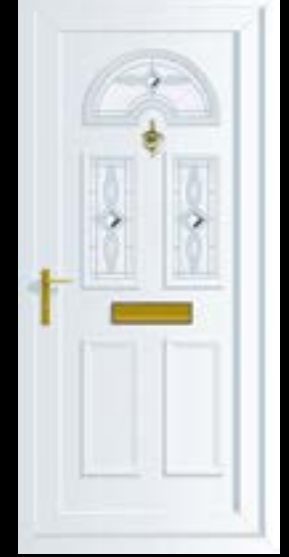
Georgian 3 CLEAR ELEGANCE