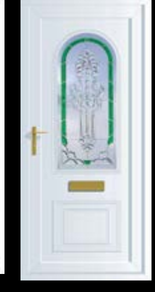
Devon NEPTUNE EMERALD