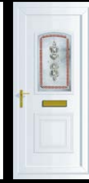
Victorian S1 RUBY