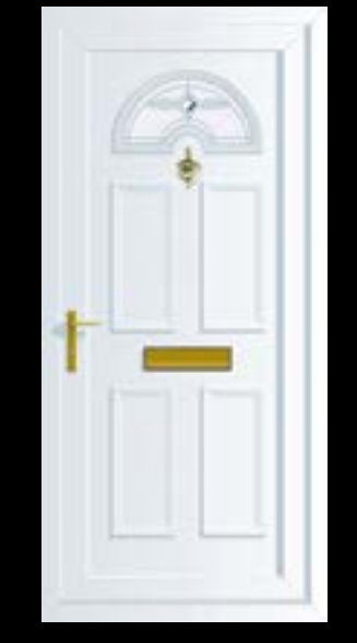
Georgian 1 CLEAR ELEGANCE