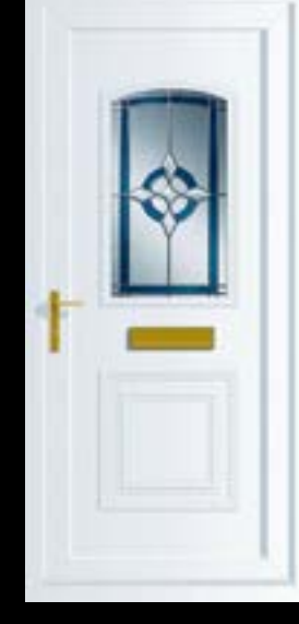
Victorian S1 DB1