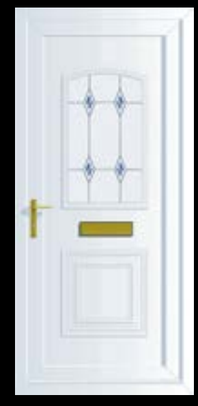
Victorian S1 FUSED GRILLE