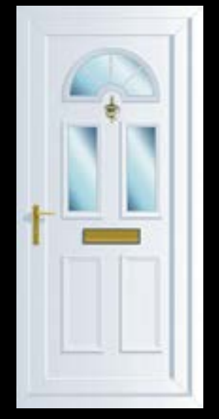
Georgian 3 GEO BAR