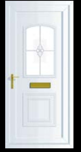
Victorian S1 SILVER GRILLE