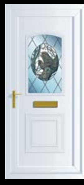
Victorian S1 OWL TRANSFER