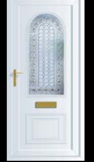
Devon FLORAL JEWEL