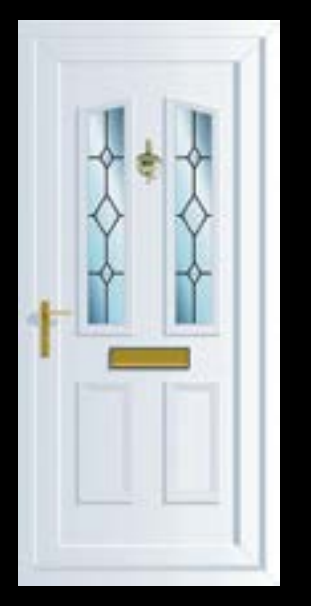
Windsor 2 BEVEL CLUSTER