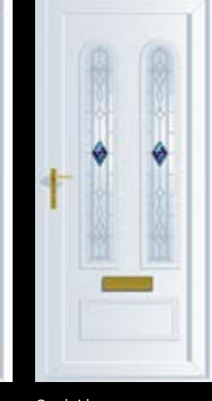
Cambridge FUSED BLUE