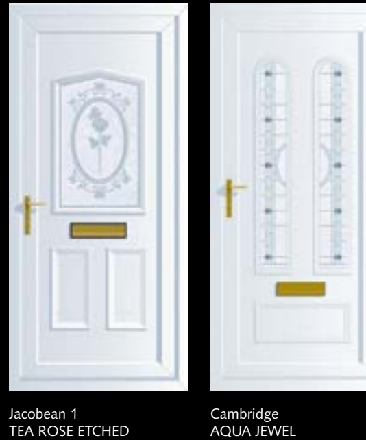
Cambridge AQUA JEWEL