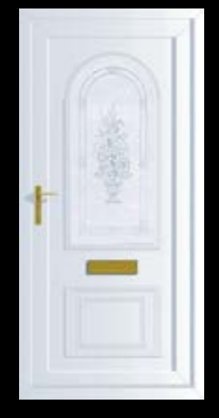
Devon VASE ETCHED