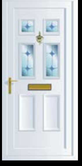
Edwardian 4 BEVEL G