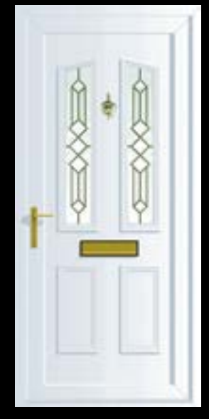
Windsor 2 ATRIA