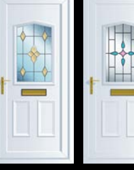
Jacobean 1 BEVEL F COLOURED