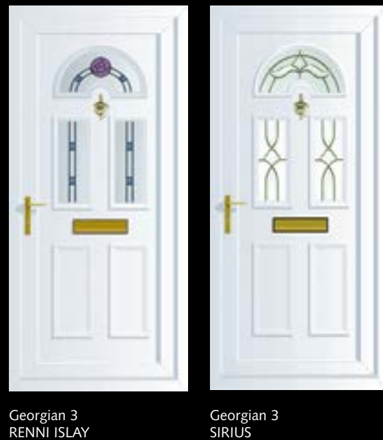
Georgian 3 SIRIUS