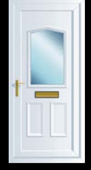
Jacobean 1 GLAZED