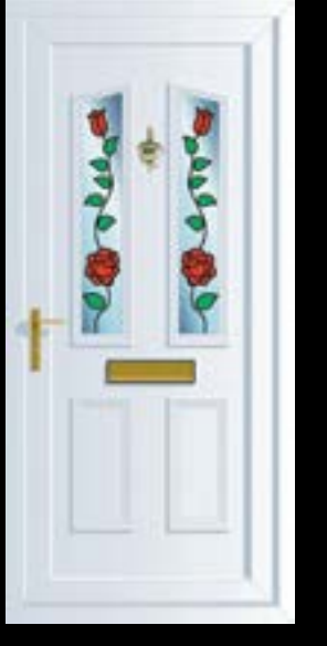
Windsor 2 CLIMBING ROSE