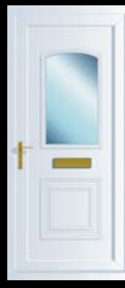
Victorian S1 GLAZED