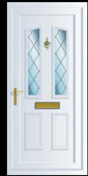
Windsor 2 DIAMOND LEAD