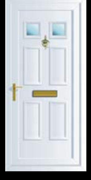
Edwardian 2 GLAZED