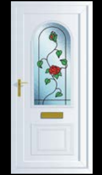
Devon WILD ROSE